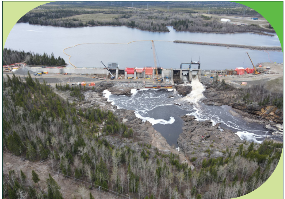
Aerial view of the Smoky Falls Dam Safety project. On left is the East Spillway which has been closed. At centre features the existing Spillway Closure and Sluiceway replacement work. On right is the West Spillway Closure.

The East Spillway involves the closure of 14 Spillways using concrete plugs. This work was completed at the beginning of the year. The East Sluiceway