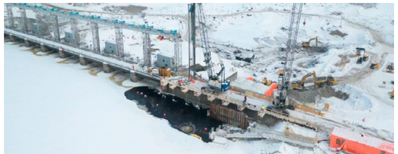
Work has begun on the east cofferdam and continues to be one of the current focuses of work on site.

As January 2021 saw an increase in COVID-19 cases across the province, the health and safety team on site continued to adapt to the ever-changing situation. As the LLDS Project was deemed essential, protocols were enhanced to ensure work continued while balancing the safety of all employees. Apart from essential project staff on-site, employees continue to work from home where possible, in support of public health measures in place.