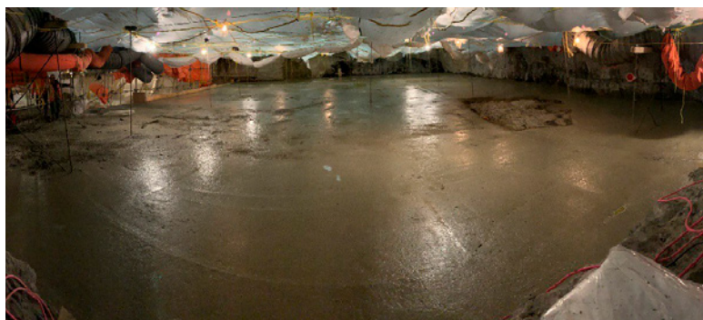
A mud slab is poured, which will act as a foundation for new sluice bays.

Construction on site is progressing, with rock excavation continuing through January & February. Installation of the barge landing is now almost complete, with remaining work to be done later this Spring when conditions allow. The West shoring wall, including excavation, was completed in January, which will support the installation of additional gates. Concrete work (as pictured at right) has been initiated on the east side which will act as a foundation for new sluice bays. The east cofferdam activities have started with the installation of a template and over 20 pipe piles to-date. Upcoming work includes a physical model witness test of flow conditions in the downstream plunge pool, and continued concrete work, on east and west sides. Even through the recent extreme cold temperatures, work is forging ahead, with heaters and pumps helping to ensure equipment is kept from freezing.