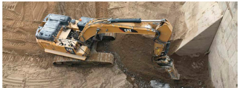
Foundation excavation with a hydraulic hammer for the new west side sluice bays.