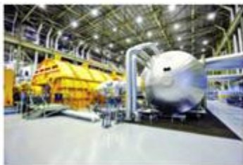
Darlington Refurbishment >