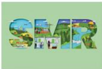
Small modular reactors >