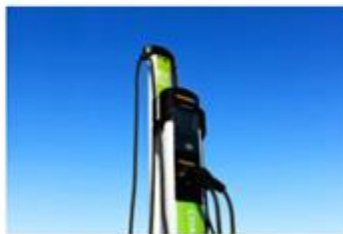
Electrification and electric vehicles >