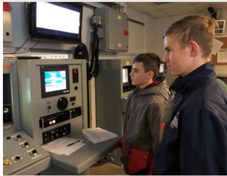
Take Our Kids to Work Day