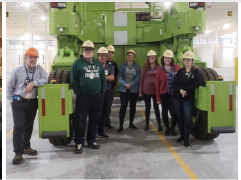
NWMO Youth Tour

The following summarizes items of interest or milestones achieved by Nuclear Waste Management and across OPG: