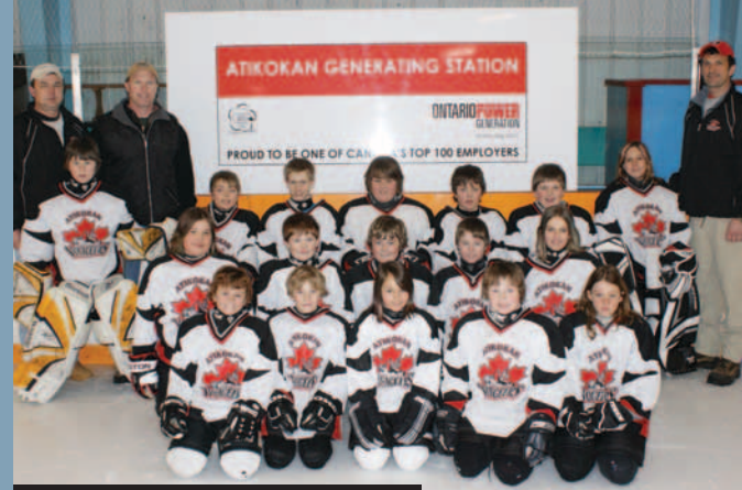
Supporting local community youth activities

As a large company and a major employer in many Ontario communities like Atikokan, OPG and its employees believe we have a responsibility to be good corporate citizens and neighbours. That means operating our electricity generating facilities in a safe, efficient and environmentally responsible manner and giving back to the community. We want to make a positive difference by supporting community projects and events, youth recreation, educational and environmental initiatives. It doesn't stop there. Our employees contribute hundreds of hours of volunteer time to community organizations.