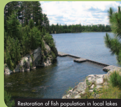
Restoration of fish population in local lakes

We share the concerns people have about carbon dioxide (CO 2 ), a greenhouse gas, and climate change. OPG is working to reduce emissions from all aspects of its business in a manner that is consistent with Ontario's regulatory framework. OPG's environmental performance is published in the annual Sustainable Development report found at opg.com .