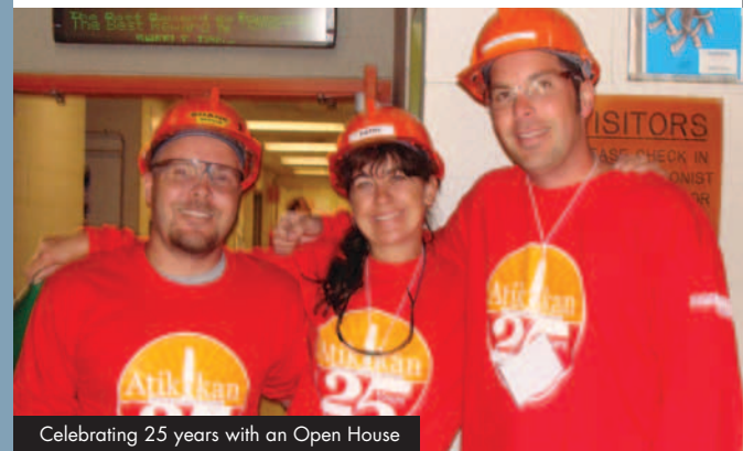
Celebrating 25 years with an Open House