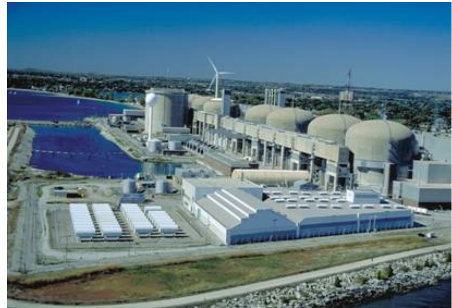
Pickering B Nuclear Station: 4 Units – 2,064 MW