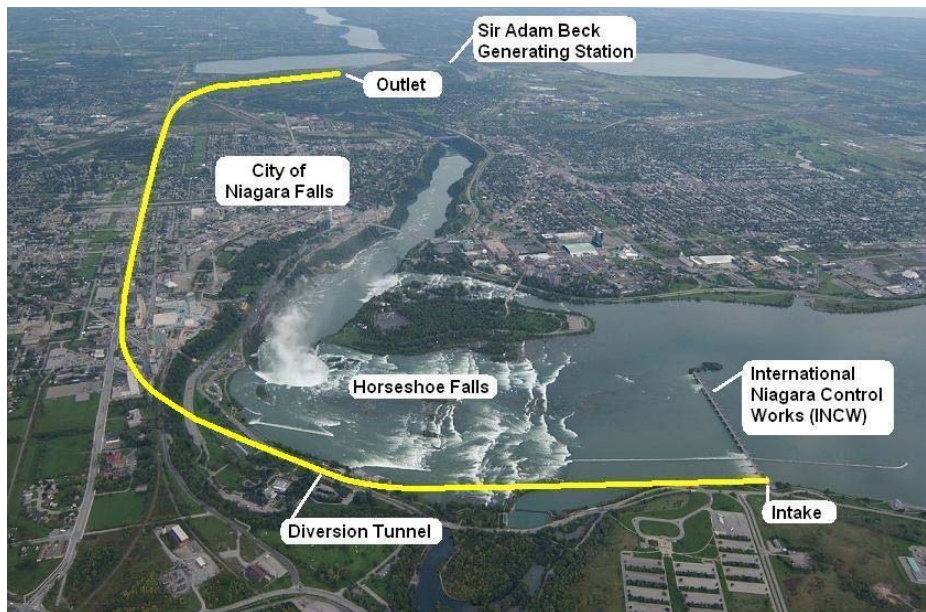
Path of the Niagara Tunnel